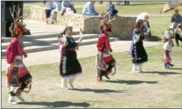
Traditional Pueblo Deer Dancers perform at the outdoor stage at NMSU.

Students at New Mexico State University commemorated American Indian Week with a week of well-attended events March 26–31.